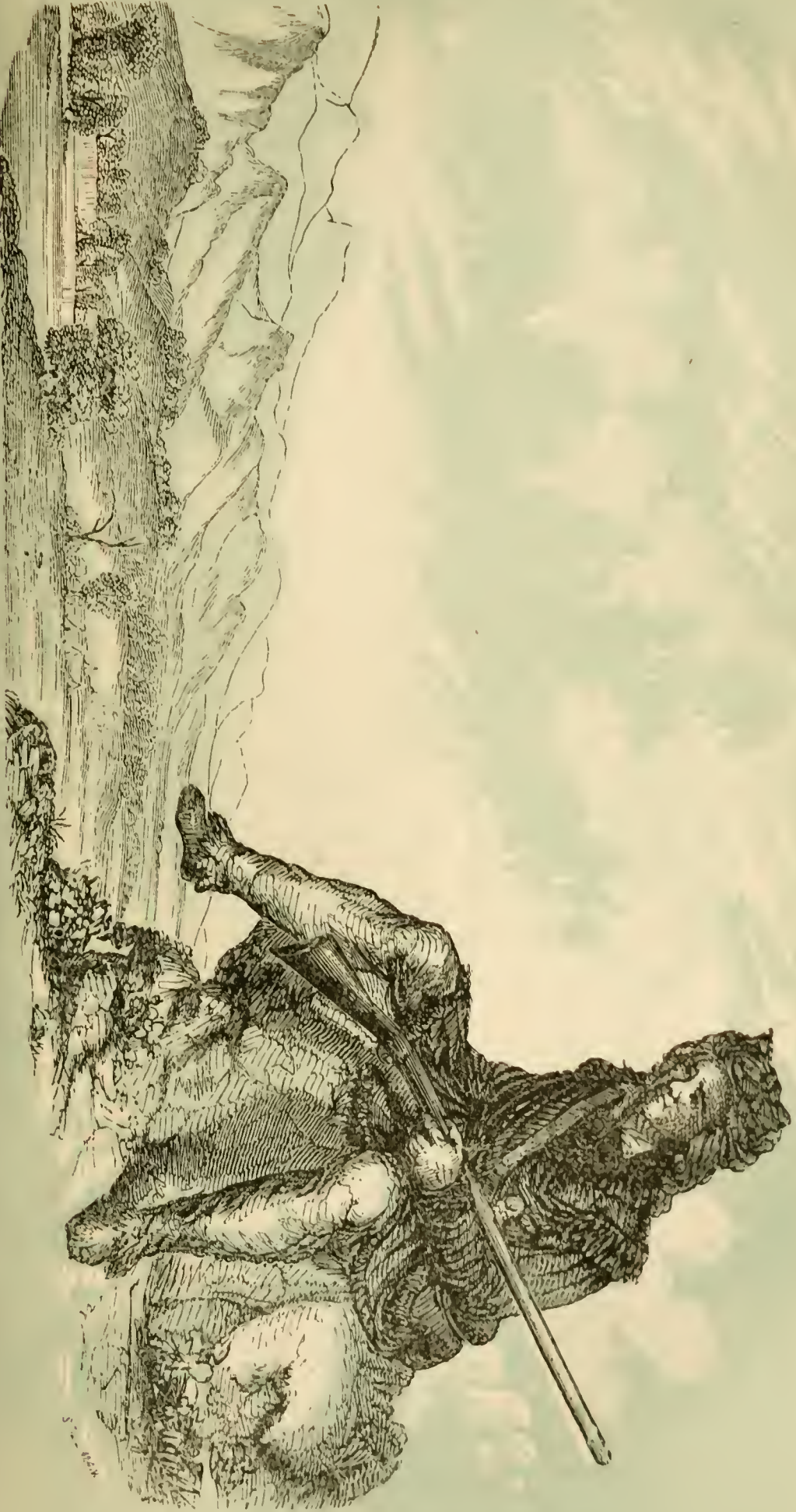
INDIAN HUNTER, DANIEL BOONE, SURVEYING HIS FUTURE POSSESSIONS.